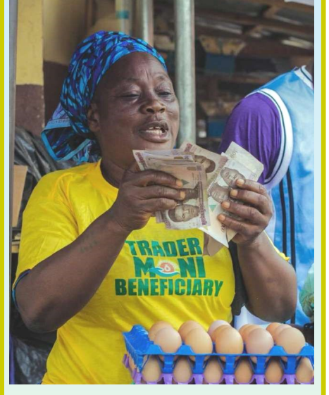
Beneficiary of the Federal Governments TraderMoni scheme

The Formality Gap particularly notes that while 37 million MSMEs exist employing 60 million Nigerians, the sector is still considered to be the most financially excluded in comparison to their counter-