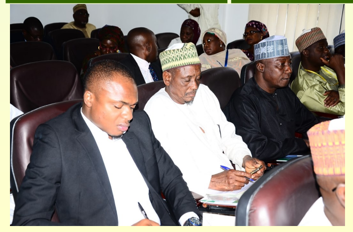
FISSCO engagement in the North West