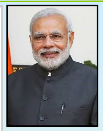
Prime Minister of India, Nerandra Modi

PMJDY is the financial inclusion program of the Government of India (Gol) that aims to expand and make affordable, access to financial services. It was launched by Prime Minister Nerandi Modi in August 2014. The Guinness Book of Record recognized the achievement of PMJDY when it opened 18million accounts in one week.