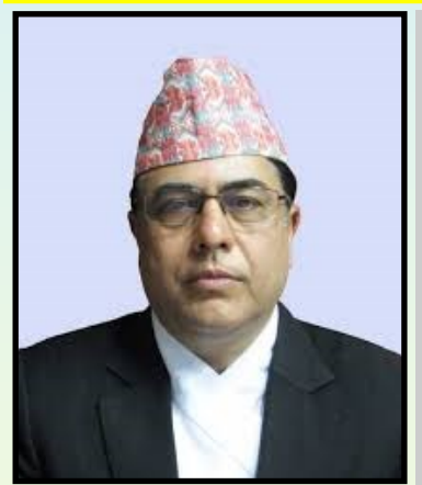
Governor of NRB, Dr. Chiranjibi Nepal