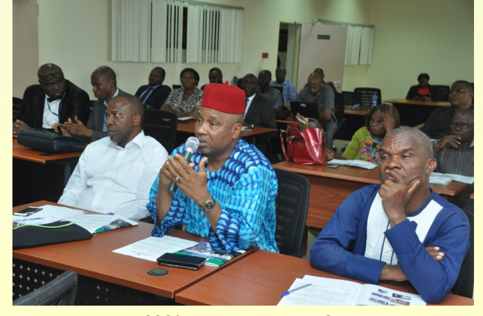
FISSCO engagement in the South East