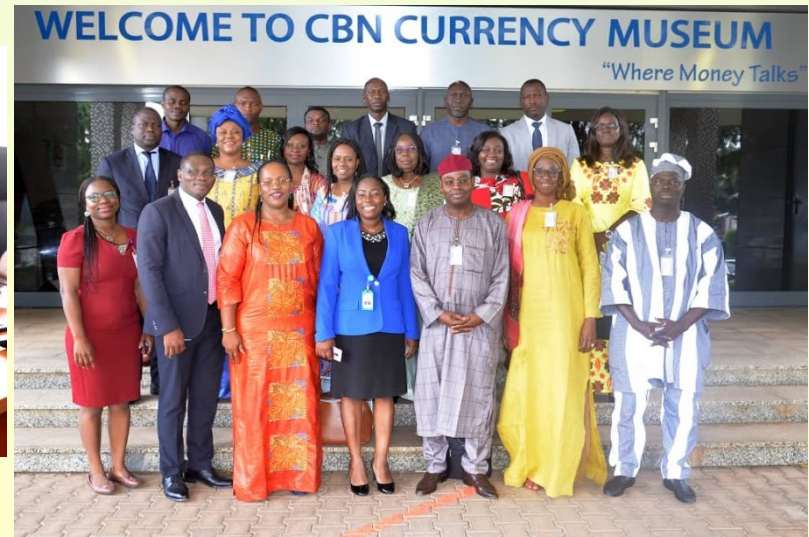
Delegates and the CBN team